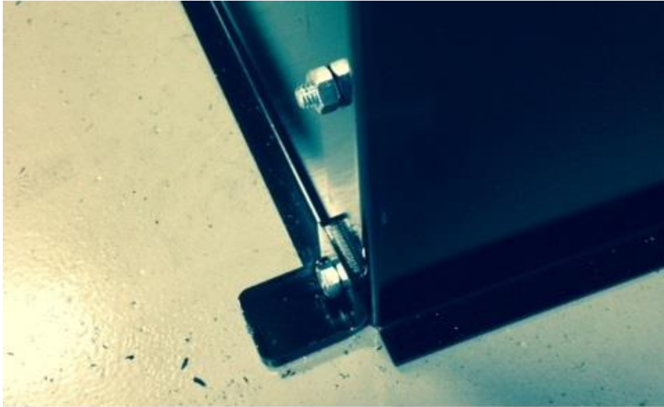
Lift tab installed